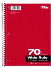
Spiral Notebook WIDE RULED