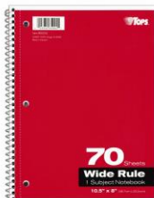
Spiral Notebook WIDE RULED